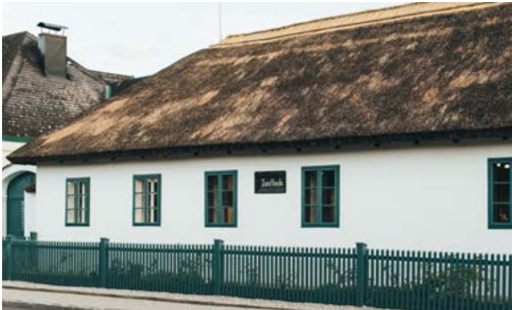
Museum of Haydn Geburtshaus Rohrau