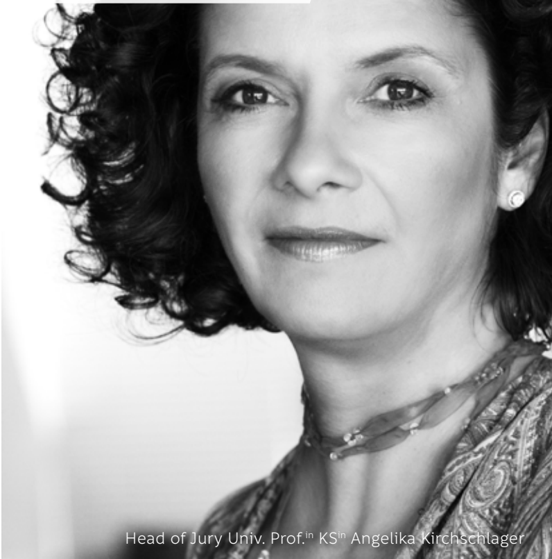
Head of Jury Univ. Prof.ª KSin Angelika Kirchschlager

8 th International Haydn Competition for Classical Lied and Aria May 22 – 24, 2026, Rohrau