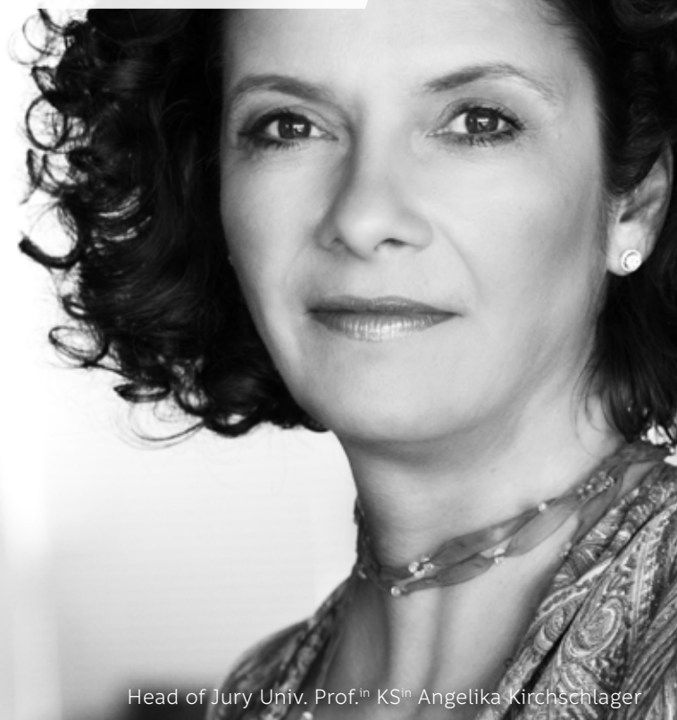
Head of Jury Univ. Prof. in KS m Angelika Kirchschlager

REGION Zum Haydn NIEDERÖSTERREICH COMPETITION