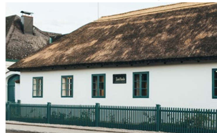
Museum of Haydn Geburtshaus Rohrau

The selection of repertory lies within the responsibility of the participant. The pieces are to be performed by heart and in the original language. Participants must submit a binding repertoire list along with their registration. Subsequent changes are not possible.