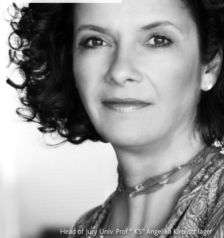
Head of Jury Univ. Prof. in KS in Angelika Kirchschrager

REGION Zum Haydn NIEDERÖSTERREICH COMPETITION