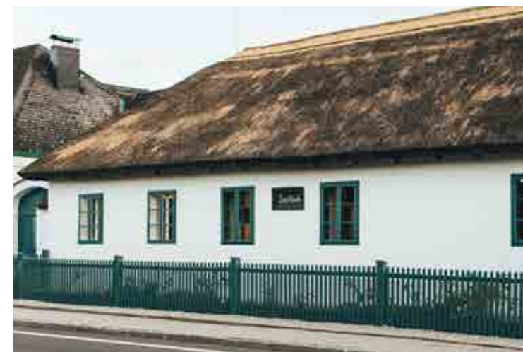
Museum of Haydn Geburtshaus Rohrau

Obere Hauptstraße 25 | A-2471 Rohrau www.haydngeburtshaus.at